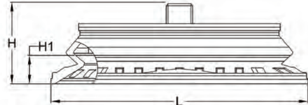
FEMALE THREADED MODELS